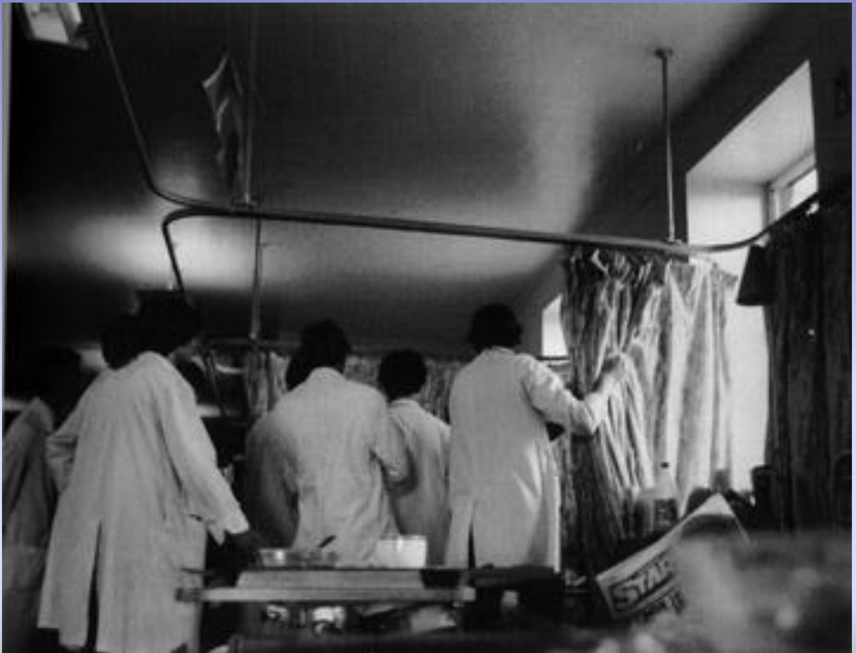
Jo Spence 1995. "The patient's perspective". In Cultural Sniping: The Art of Transgression .